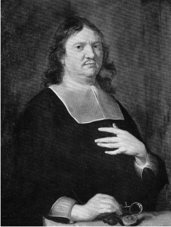
Figure 3. Henry Oldenburg, circa 1665. Portrait attributed to John Van Cleef. Oldenburg was the first editor of Philosophical Transactions of the Royal Society of London, the longest surviving scientific journal that still is published today.

Through Oldenburg's guidance, the Transactions published a wealth of valid scientific ideas and observations. For example, Isaac Newton, Rene Descartes, Benedict de Spinoza, Gottfried Leibniz, Marcello Malpighi, Christopher Wren, and Robert Boyle are among the list of correspondents. However, many of the papers that were published at that time have been shown to be mere speculation and fantasy. There are many communications that describe observations of mermaids, perpetual clocks, and the transformation of metals into gold.